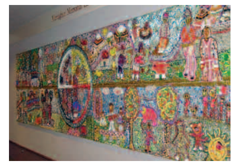
"Circle of Life" is installed in the Marquette University Alumni Memorial Union.

A diverse group of students came together in the Milwaukee Circle of Life Mural Project in 2007, a project that helped them learn about other cultures, as well as to examine their